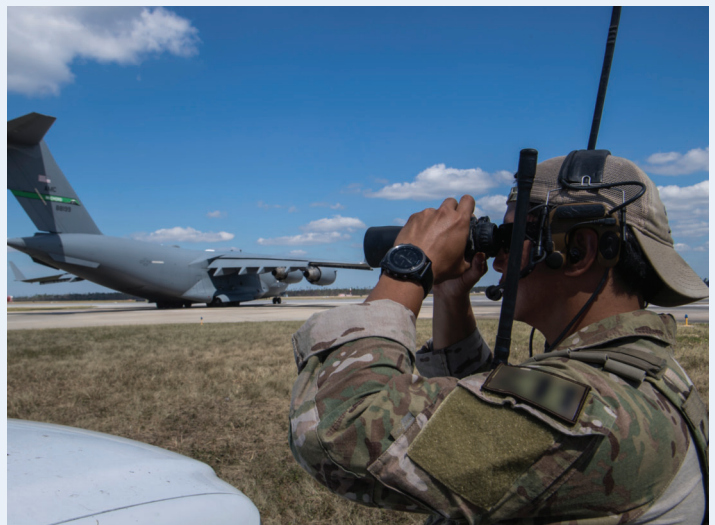
A Special Tactics Airman with the 23rd Special Tactics Squadron controls an aircraft at Tyndall Air Force Base, Fla., Oct. 14. Special Tactics Airmen and supplies were transported to Tyndall Air Force Base, Fla., to provide relief efforts following the devastation of Hurricane Michael.

Editor’s Note: Information from a 621st Contingency Response Wing Public Affairs article was used in this story.