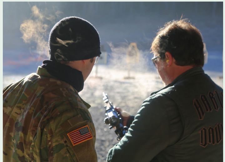
Soldiers with the 1st Special Forces Group (Airborne), and their families practice firing weapons unique to Special Forces Dec. 6, during the Menton Week family weapons familiarization event. The 1st SFG(A) and the Canadian Special Operations Regiment celebrate their legacy as premier special operations professionals during the first week of December, and to commemorate the deactivation of the First Special Service Force.

“The camaraderie, the bond between our men, regardless of nationality, remains both a source of comfort and pride,” he said. “We honor all those who gave the supreme sacrifice, but we also honor those who, daring to die, survived. It continues to be an honor to serve alongside our American comrades around the world.”