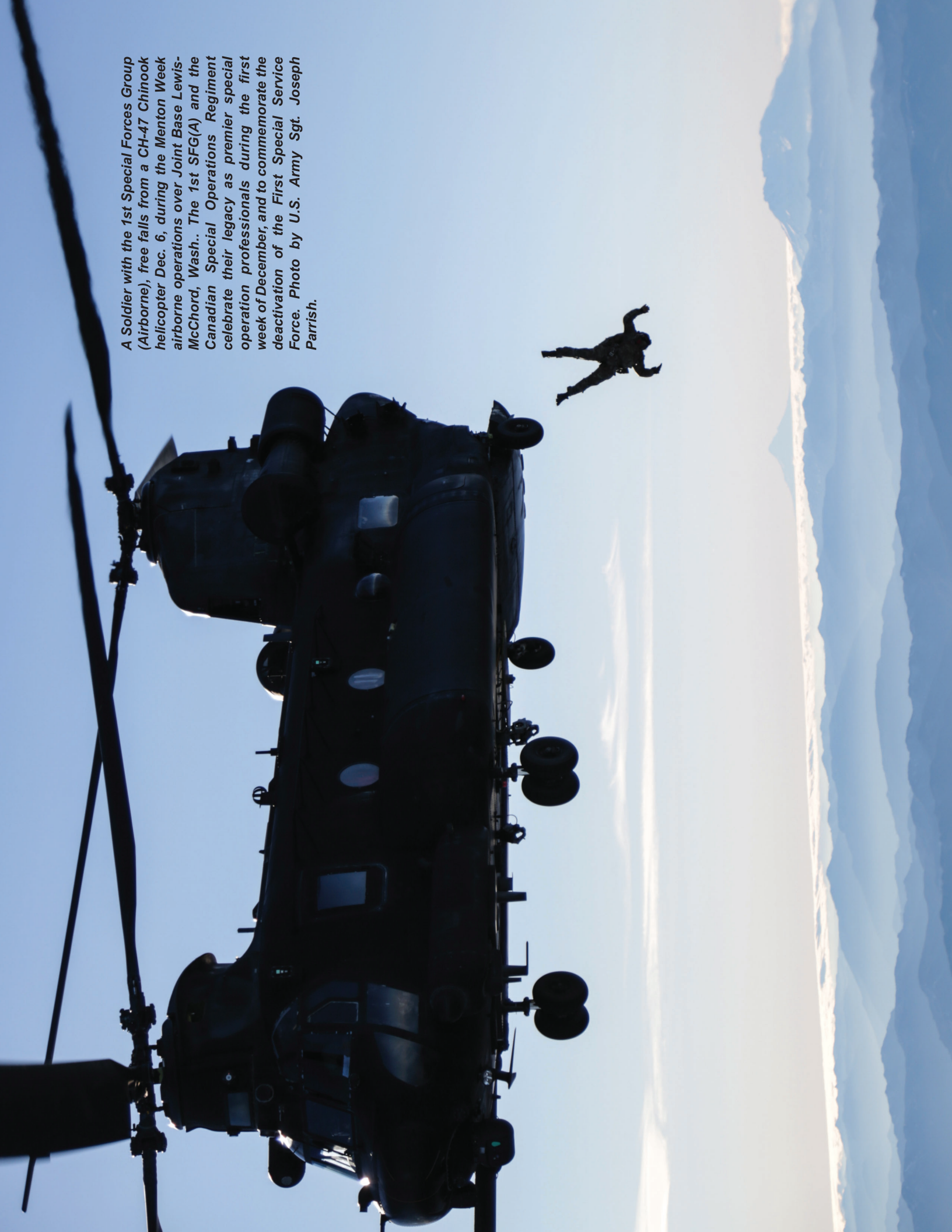
A Soldier with the 1st Special Forces Group (Airborne), free falls from a CH-47 Chinook helicopter Dec. 6, during the Menton Week airborne operations over Joint Base Lewis-McChord, Wash.. The 1st SFG(A) and the Canadian Special Operations Regiment celebrate their legacy as premier special operation professionals during the first week of December, and to commemorate the deactivation of the First Special Service Force.