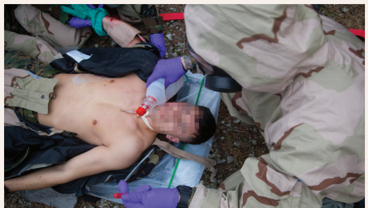
Marines and Sailors with Marine Corps Forces Special Operations Command administer emergency medical treatment to a simulated casualty during an Advanced Chemical, Biological, Radiological, and Nuclear Medical Course at Camp Lejeune, N.C., Dec. 13.