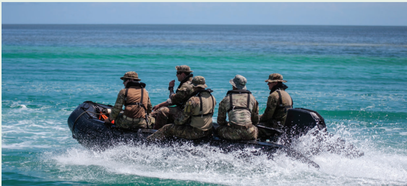
Soldiers attending the Special Forces Combat Diver Qualification Course practice skills needed to perform amphibious infiltration, June 7, in Key West, Fla.

The Special Forces Combat Diver Qualification Course is a seven-week course taught by the U.S. Army Special Forces Underwater Operations School at Key West, Florida, and is widely recognized as one of the most difficult advanced skills courses for special operations forces. These SOF soldiers from the United States and partner nations graduate the course ready and capable of the elevated skills needed to operate in the multi-domain environment of current operations.