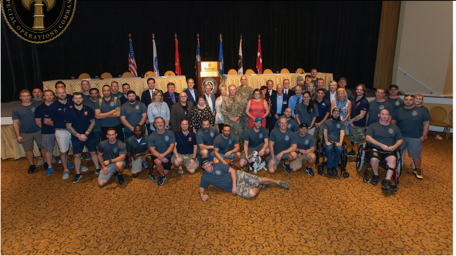
Military Adaptive Sports Program athletes and Patriot Award recipients gather at the annual Care Coalition Conference Nov. 11 at the Innisbrook Salamander Golf & Spa Resort in Palm Harbor, Fla. The event brought together military and civilian organizations to network and collaborate on best practices for recovery care, military adaptive sports program, and transition of SOF wounded, injured and ill servicemembers.