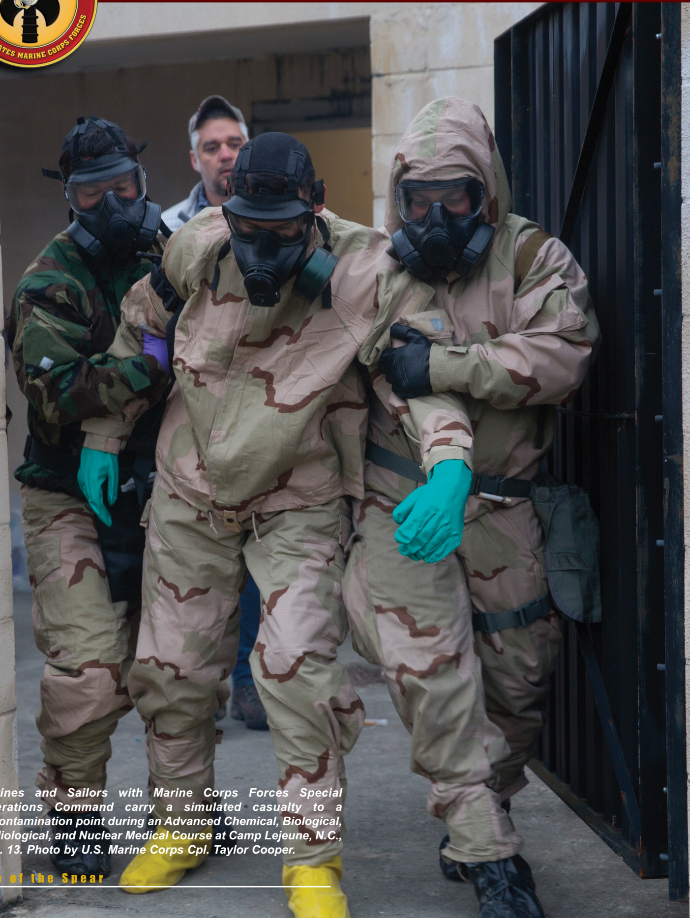
Marines and Sailors with Marine Corps Forces Special Operations Command carry a simulated casualty to a decontamination point during an Advanced Chemical, Biological, Radiological, and Nuclear Medical Course at Camp Lejeune, N.C., Dec. 13.