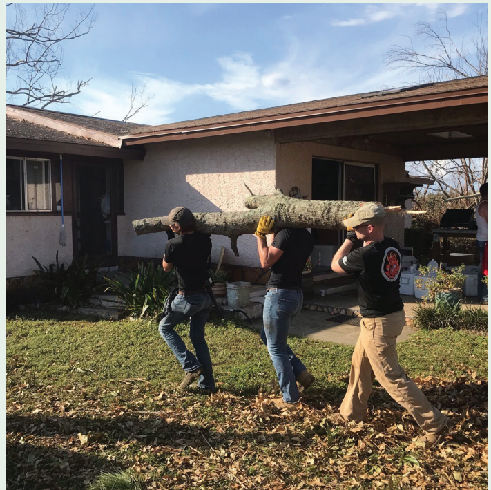
Soldiers from the 7th Special Forces Group (Airborne) assisted in relief efforts, Oct. 12, in the vicinity of Panama City after Hurricane Michael made landfall Oct 10. About 500 Soldiers a week volunteered to clear debris and other essential tasks in areas affected by the storm.