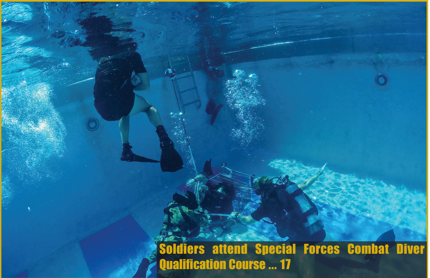
Soldiers attend Special Forces Combat Diver Qualification Course ... 17