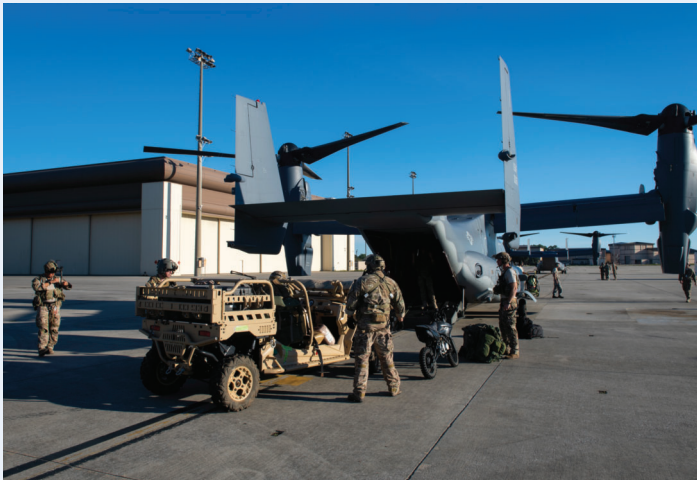
U.S. Air Force Special Tactics Airmen with the 23rd Special Tactics Squadron load cargo onto a CV-22 Osprey tiltrotor aircraft assigned to the 8th Special Operations Squadron at Hurlburt Field, Fla., Oct. 11. Special Tactics Airmen and supplies were transported to Tyndall Air Force Base, Fla., to provide relief efforts following the devastation of Hurricane Michael, one of the most intense hurricanes to ever hit the United States.