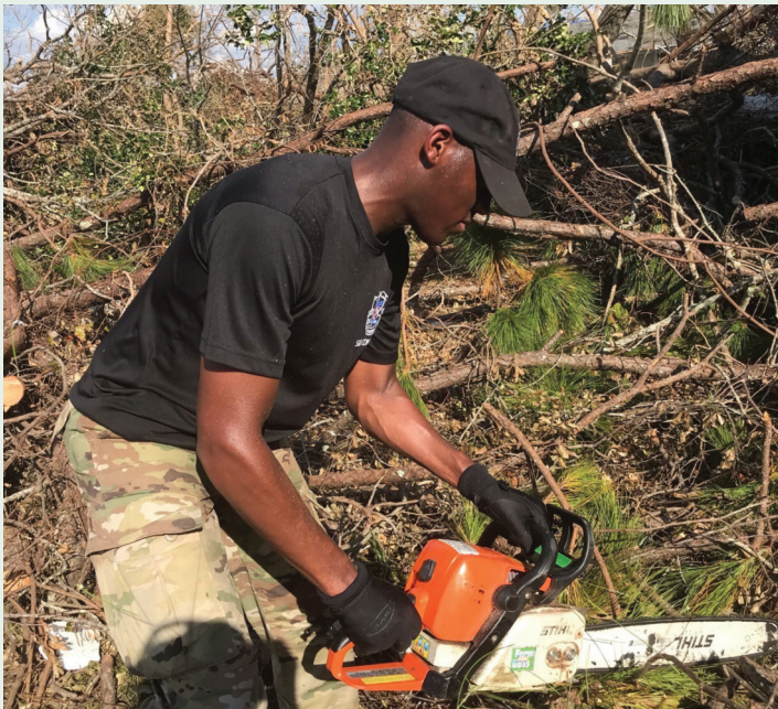
A Soldier from the 7th Special Forces Group (Airborne) assists in relief efforts, Oct. 12, in the vicinity of Panama City after Hurricane Michael made landfall Oct. 10.