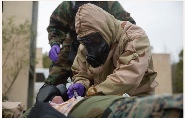
Marines and Sailors with Marine Corps Forces Special Operations Command begin giving a simulated casualty medical treatment during an Advanced Chemical, Biological, Radiological, and Nuclear Medical Course at Camp Lejeune, N.C., Dec. 13.

medical personnel to work together in a field setting, while wearing personal protective equipment, with the goal of exercising clinical and planning strategies that facilitate self-recovery from a CBRN event. The problem sets presented are designed to help improve the outcomes of multisystem trauma patients who require decontamination as well as treatment for sign and symptoms of CBRN agent toxicity.