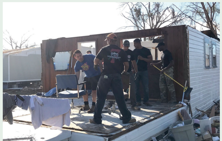
Soldiers from the 7th Special Forces Group (Airborne) assist in relief efforts, Oct. 12, in the vicinity of Panama City after Hurricane Michael made landfall Oct. 10.

Efforts like this prove the 7th SFG(A) and the Army are ready and always willing to help those in need. Providing humanitarian assistance is how we continue to foster great relationships with the community that we call home.