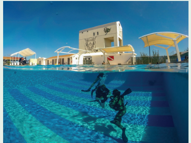
U.S. Army Cadre with Special Forces Combat Diver Qualification Course monitor a student during rescue dive training, June 6, in Key West, Fla.