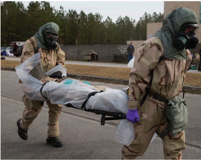
Marines and Sailors with Marine Corps Forces Special Operations Command carry a simulated casualty to a decontamination zone for medical treatment during an Advanced Chemical, Biological, Radiological, and Nuclear Medical Course at Camp Lejeune, N.C., Dec. 13.