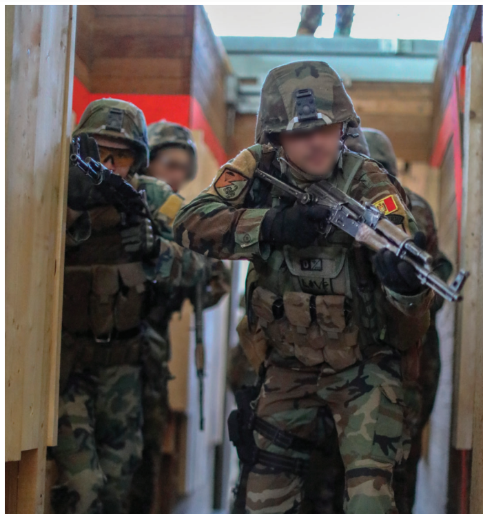
Special Operations Forces from the Republic of Moldova Armed Forces practice room clearing at Grafenwoehr Training Area, Germany Sept. 12 during Saber Junction 18.

“Our responsibility as the special operations task group and headquarters support is setting up common ground to integrate with other SOF operators and interoperate with a conventional force on a brigade level,” said an Albanian Army special operations forces sergeant major. “In order to succeed in a real battlefield situation, it